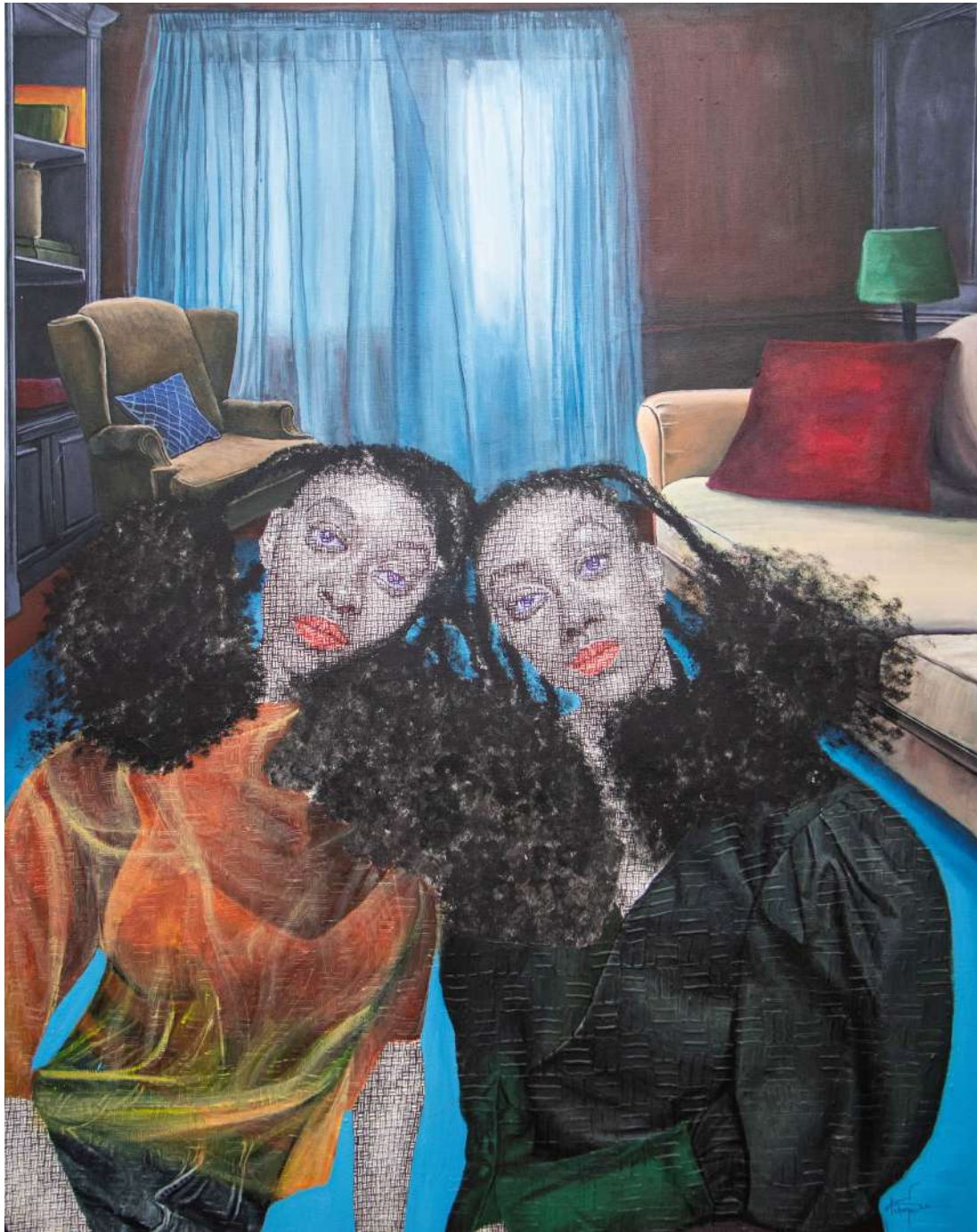
Feel at Home II , 2020 Pen and Acrylic on canvas 121cm x 152cm