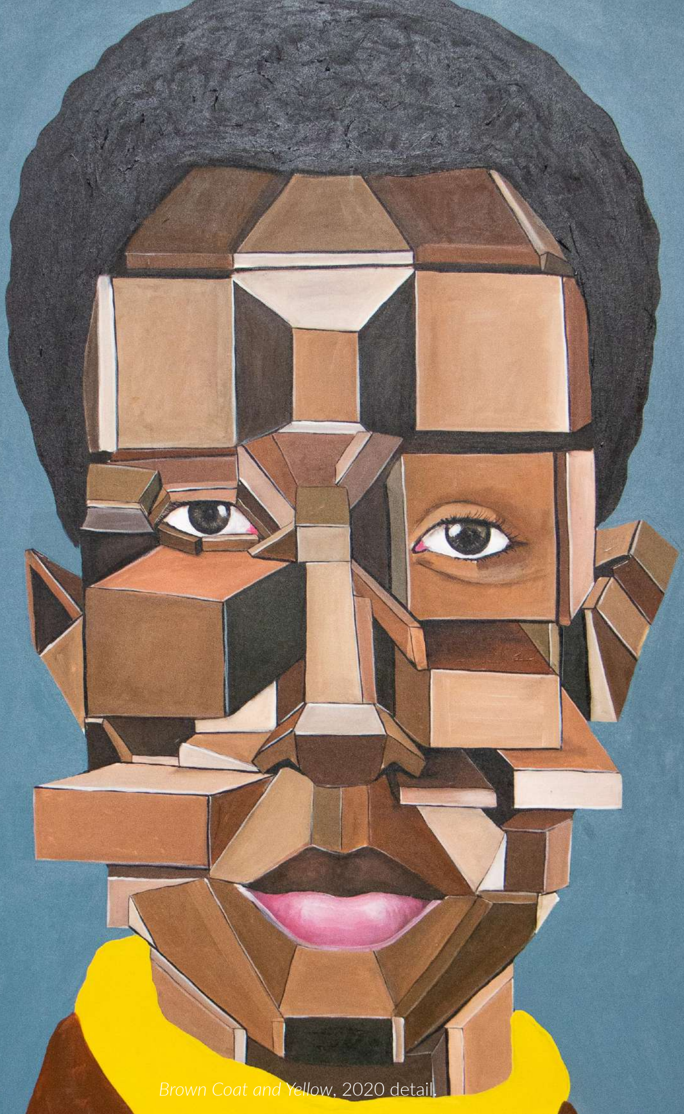
Brown Coat and Yellow, 2020 detail.