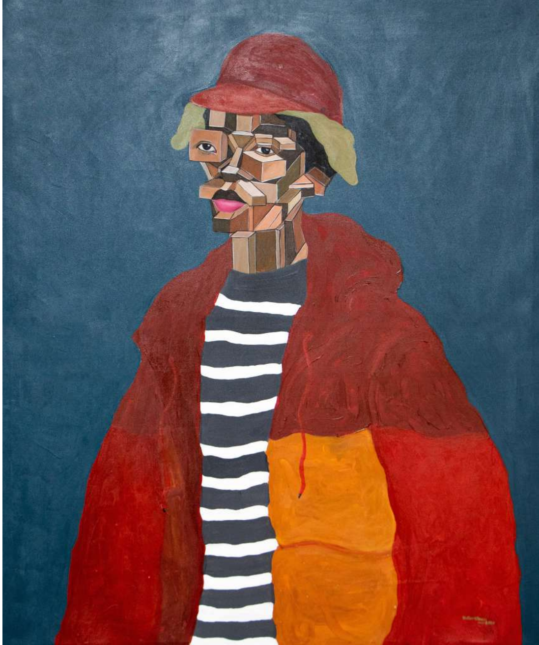
Dream Boy , 2020 Acrylic on canvas 99cm x 120cm