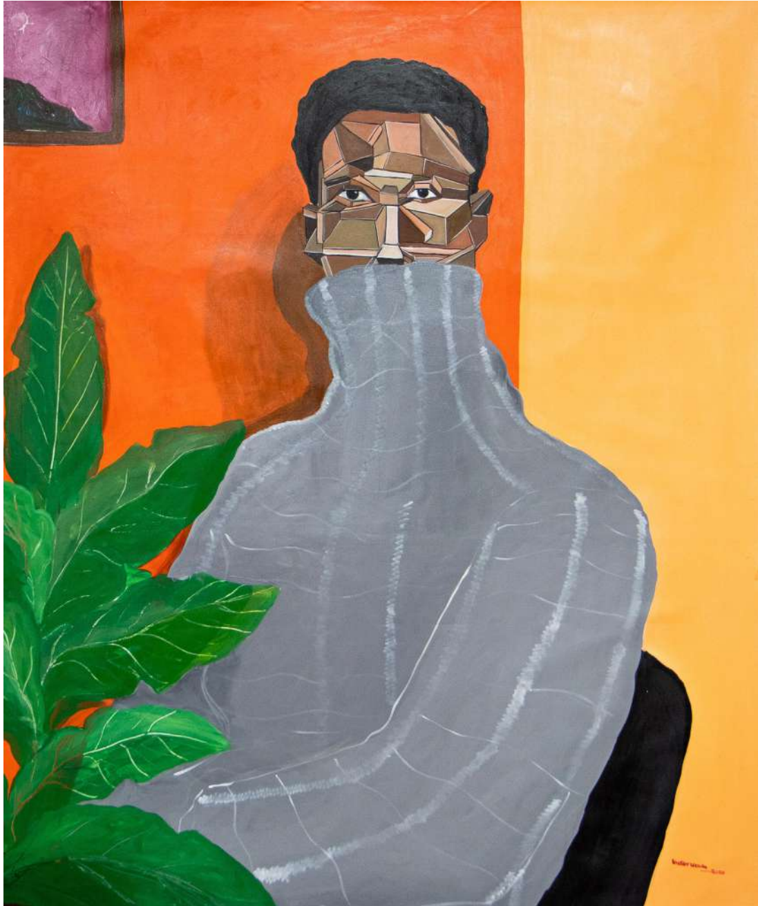
My Space , 2020 Acrylic on canvas 109cm x 138cm