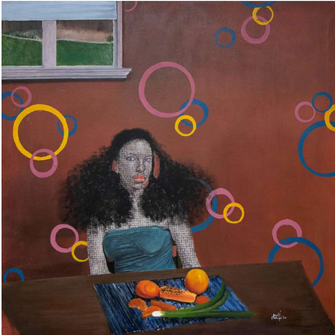
Home Alone, 2020 Pen and Acrylic on canvas 121cm x 121cm