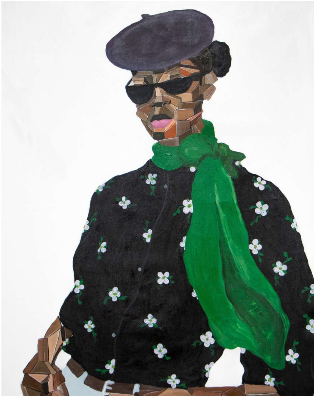
Shade and Green Scarf, 2020 Acrylic on canvas 78cm x 116cm