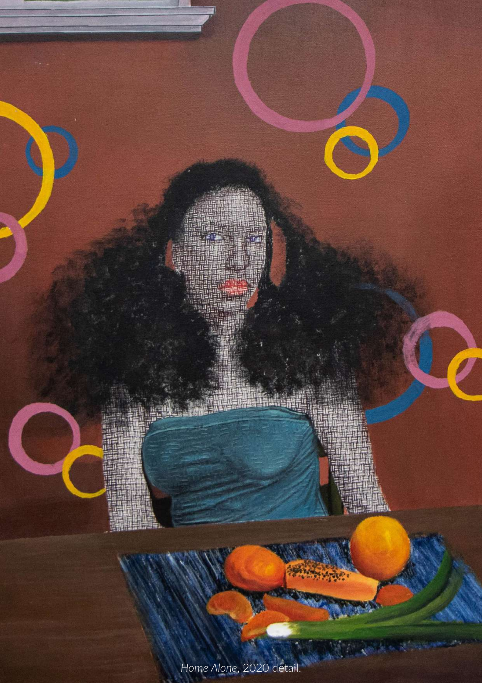
Home Alone, 2020 detail.