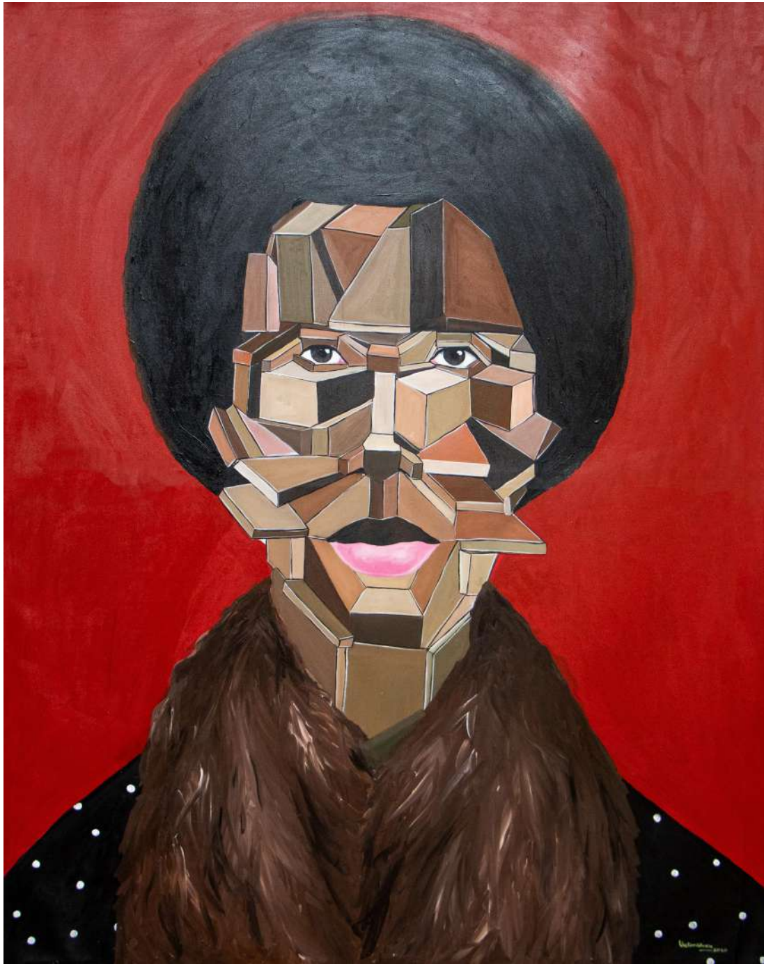
Black Dress and Scarf, 2020 Acrylic on canvas 117cm x 147cm