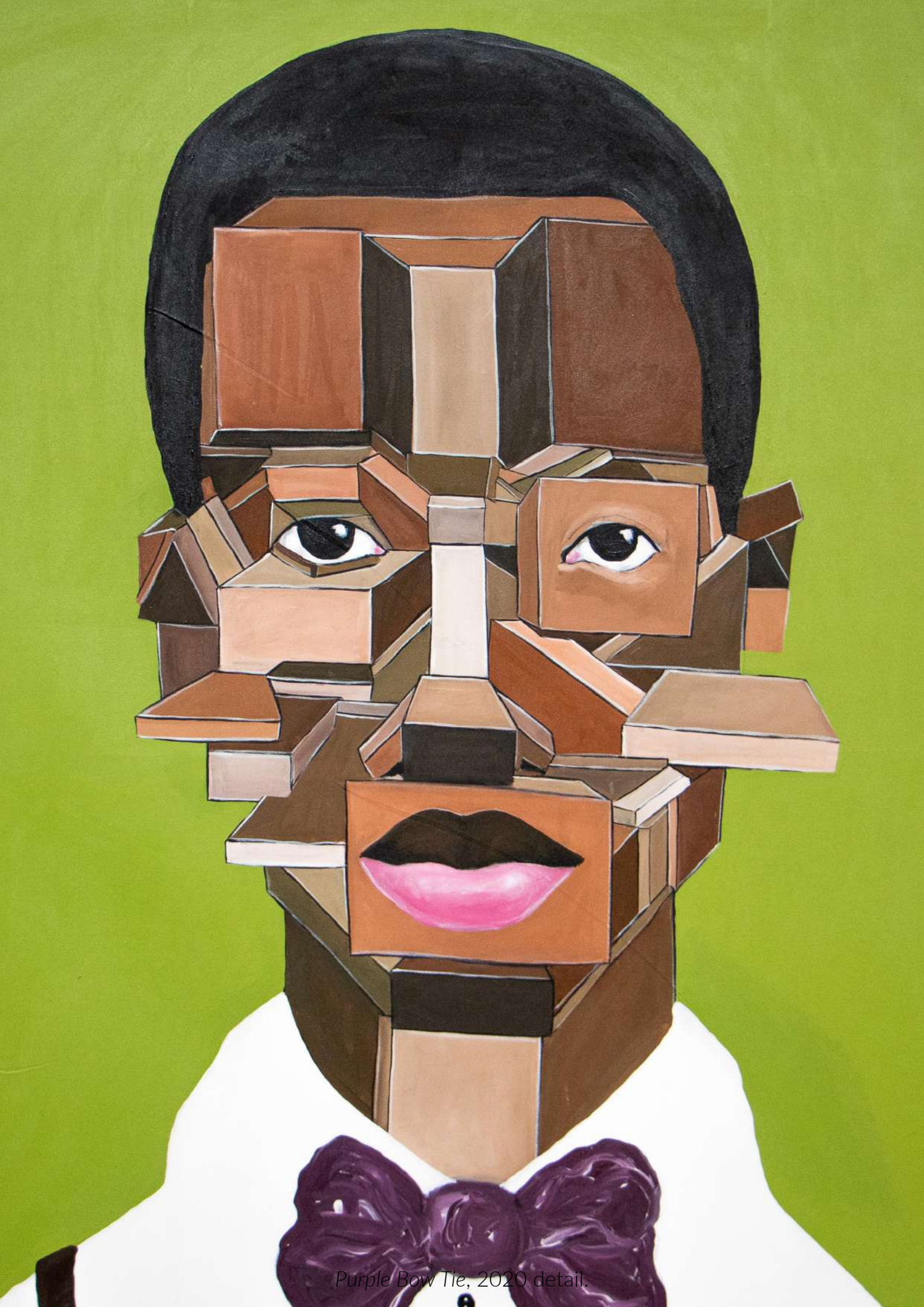
Purple Bow Tie, 2020 detail.