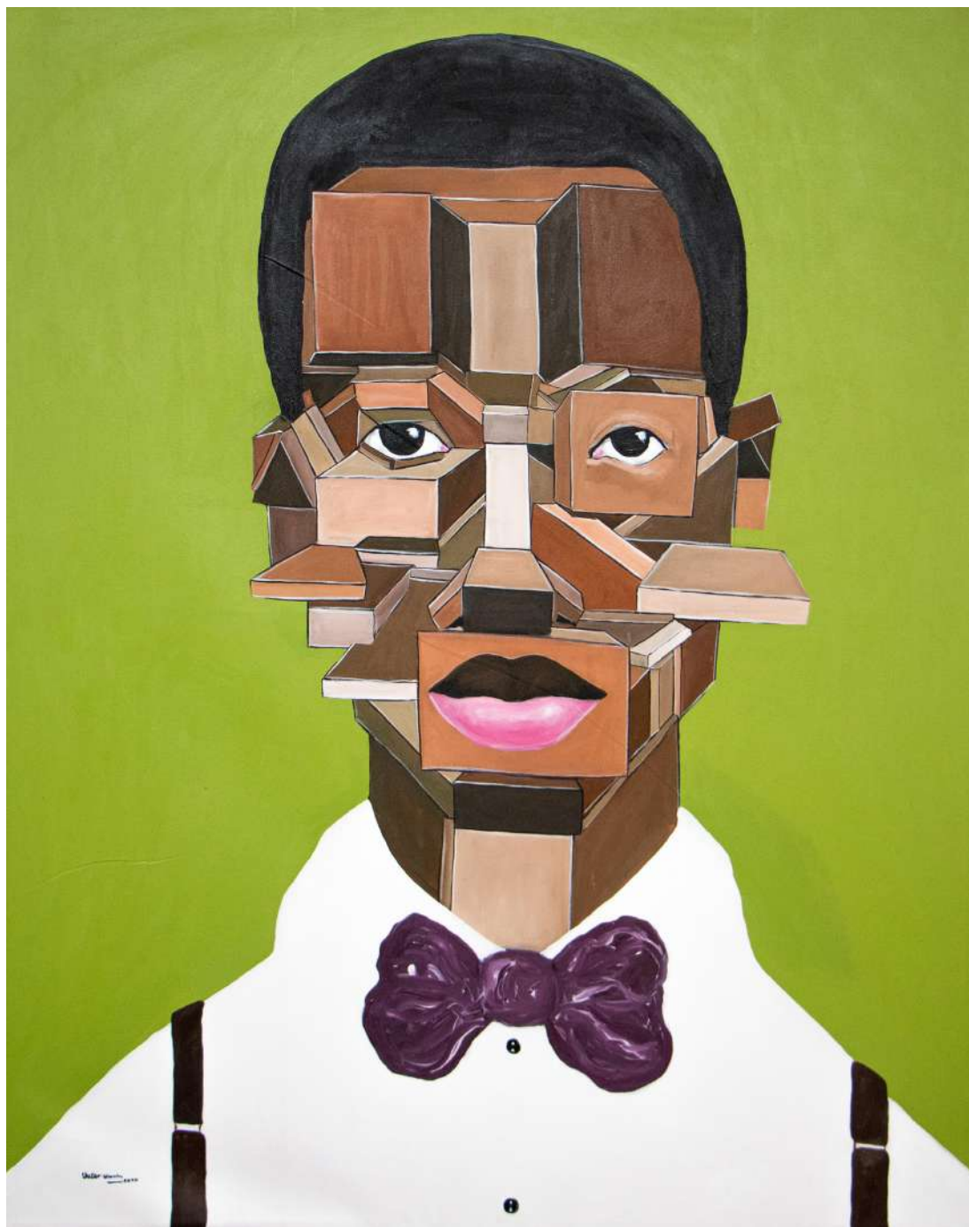
Purple Bow Tie, 2020 Acrylic on canvas 117cm x 147cm