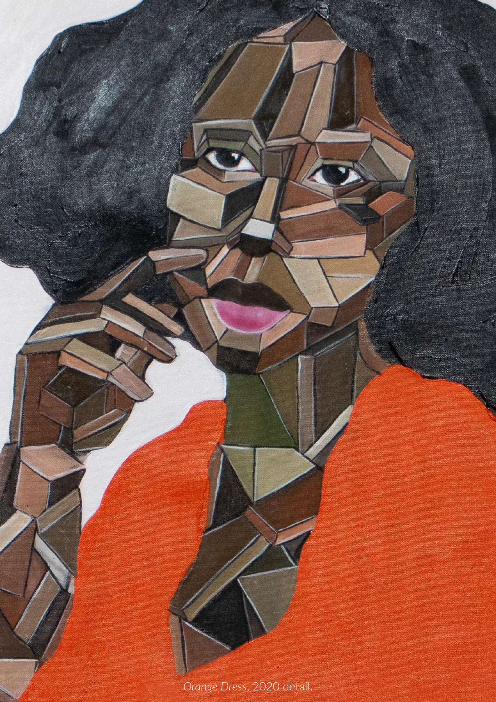
Orange Dress, 2020 detail.