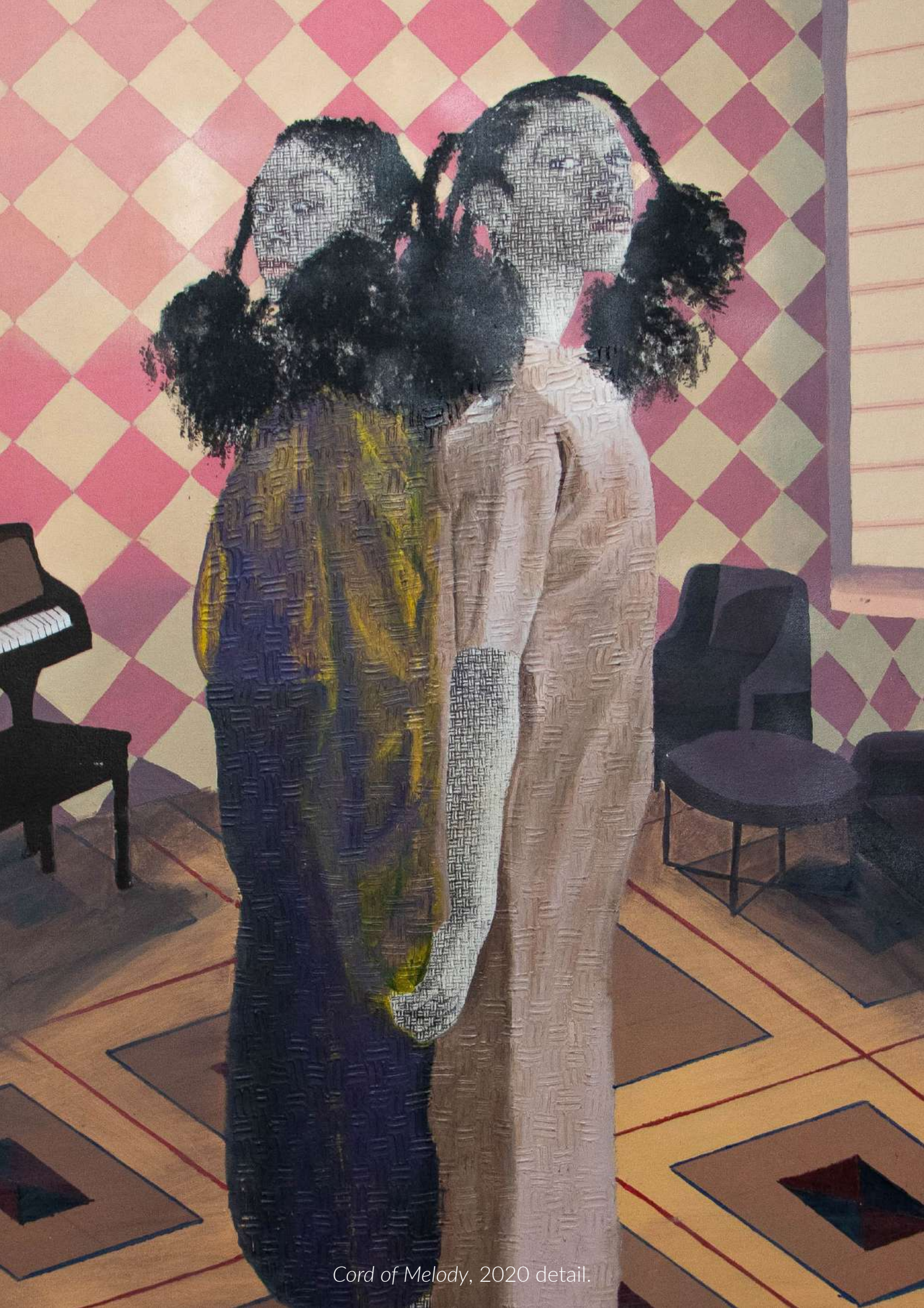
Cord of Melody, 2020 detail.