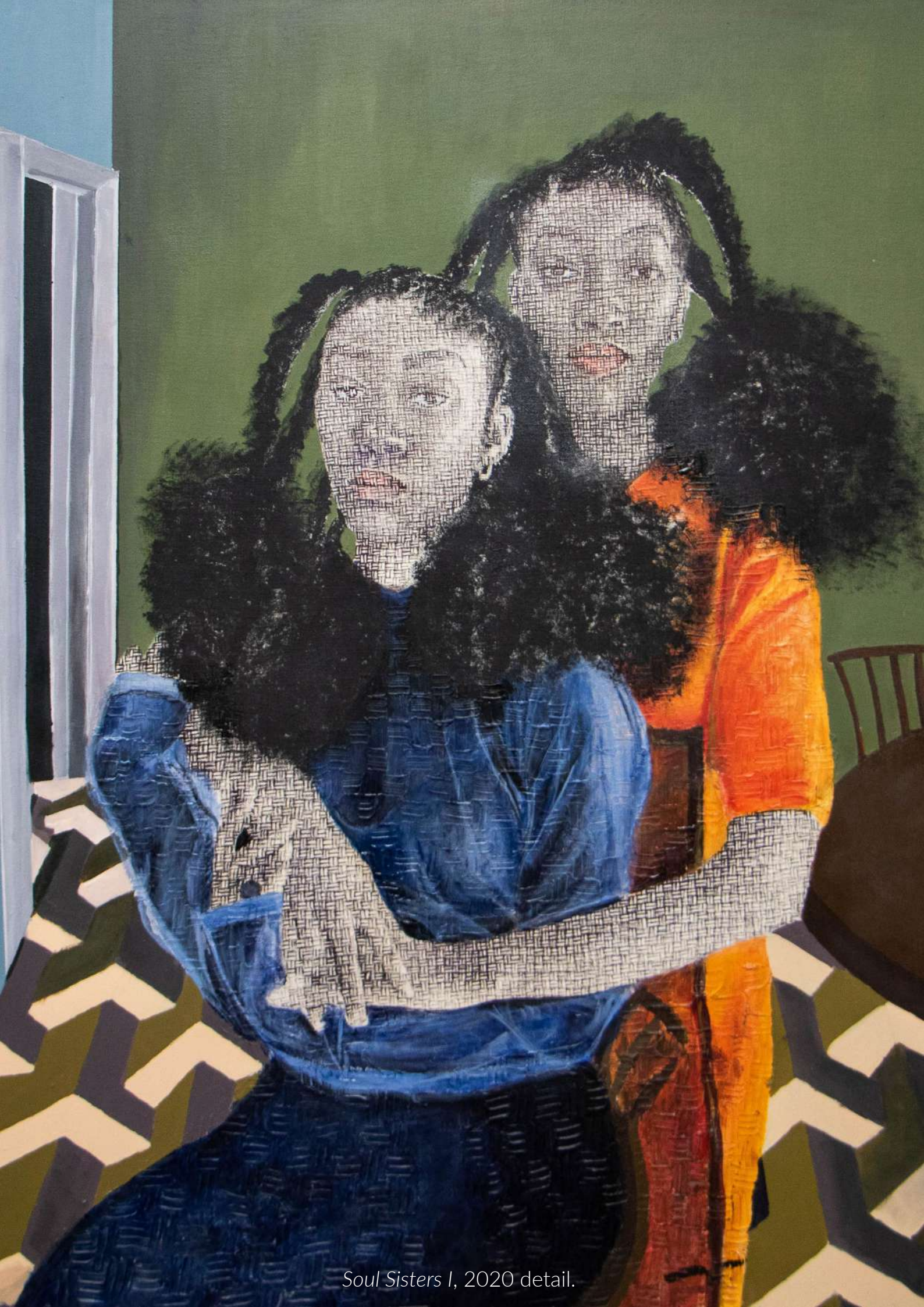
Soul Sisters I , 2020 detail.