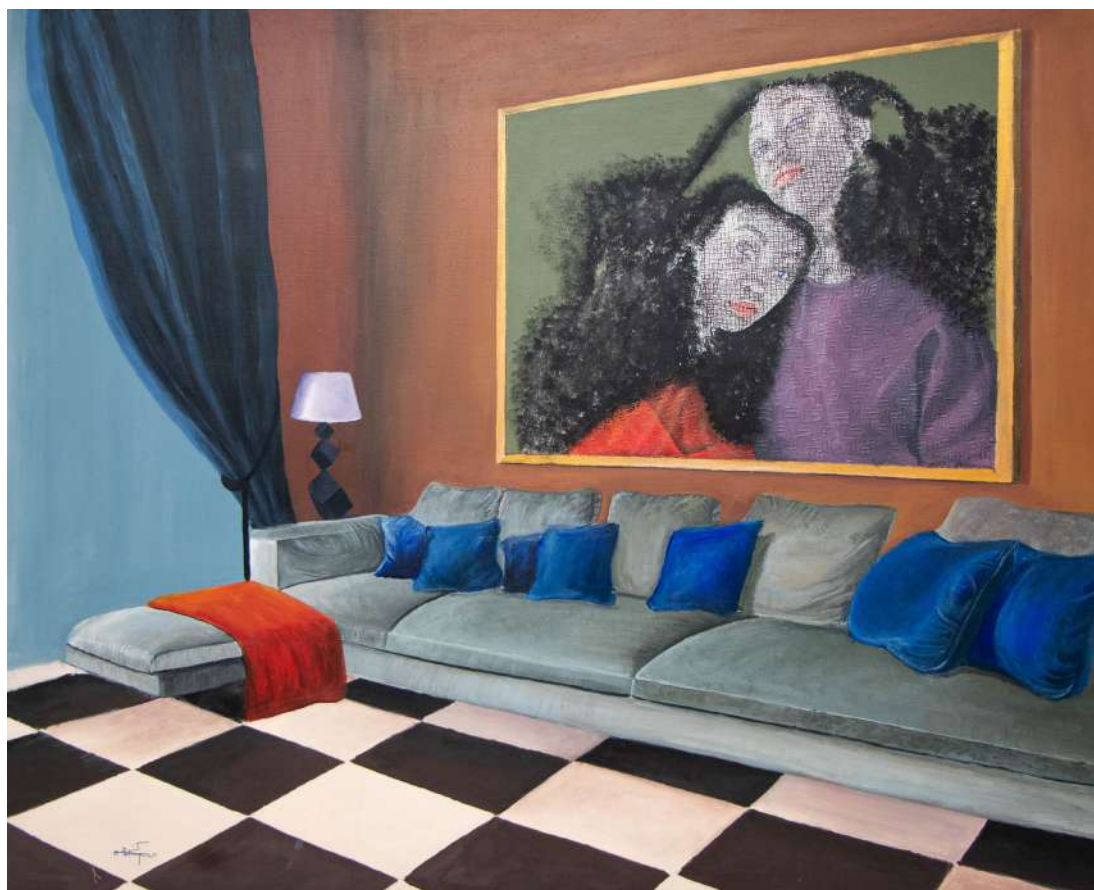
Feel at Home I , 2020 Pen and Acrylic on canvas 151.5cm x 121cm