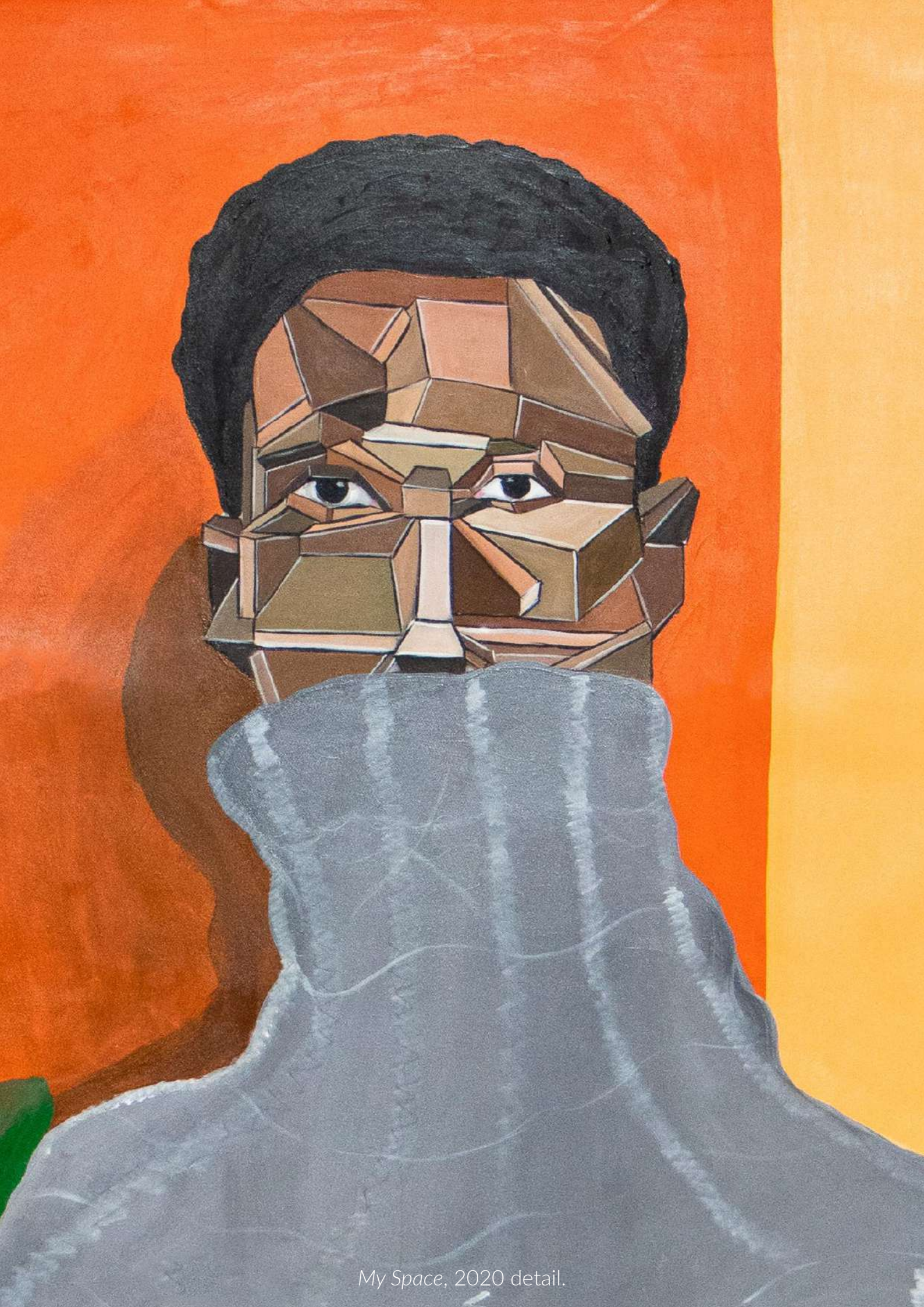
My Space, 2020 detail.