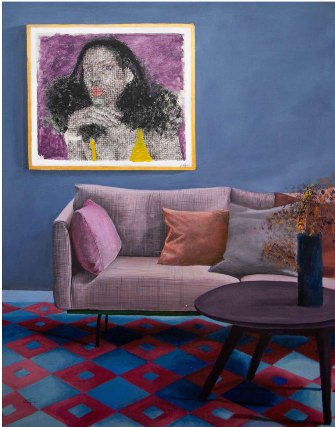
Picture Frame, 2020 Pen and Acrylic on canvas 121cm x 151cm