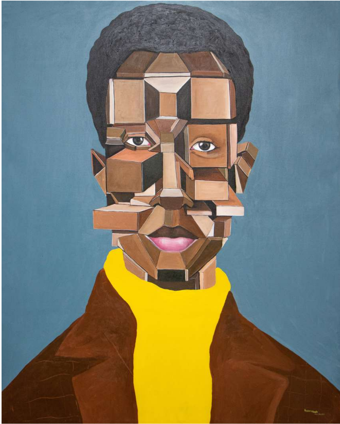
Brown Coat and Yellow, 2020 Acrylic on canvas 117cm x 147cm