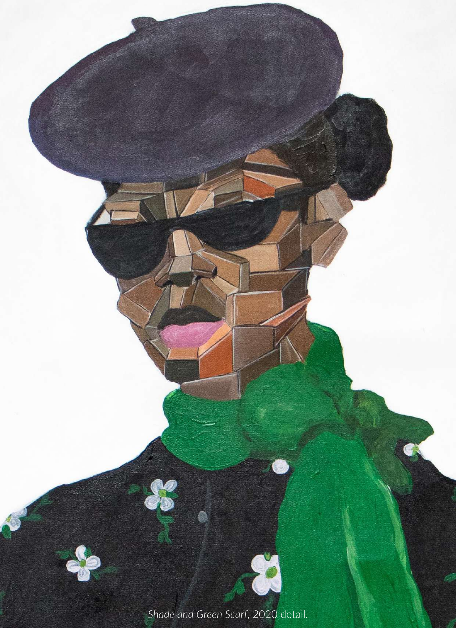
Shade and Green Scarf, 2020 detail.