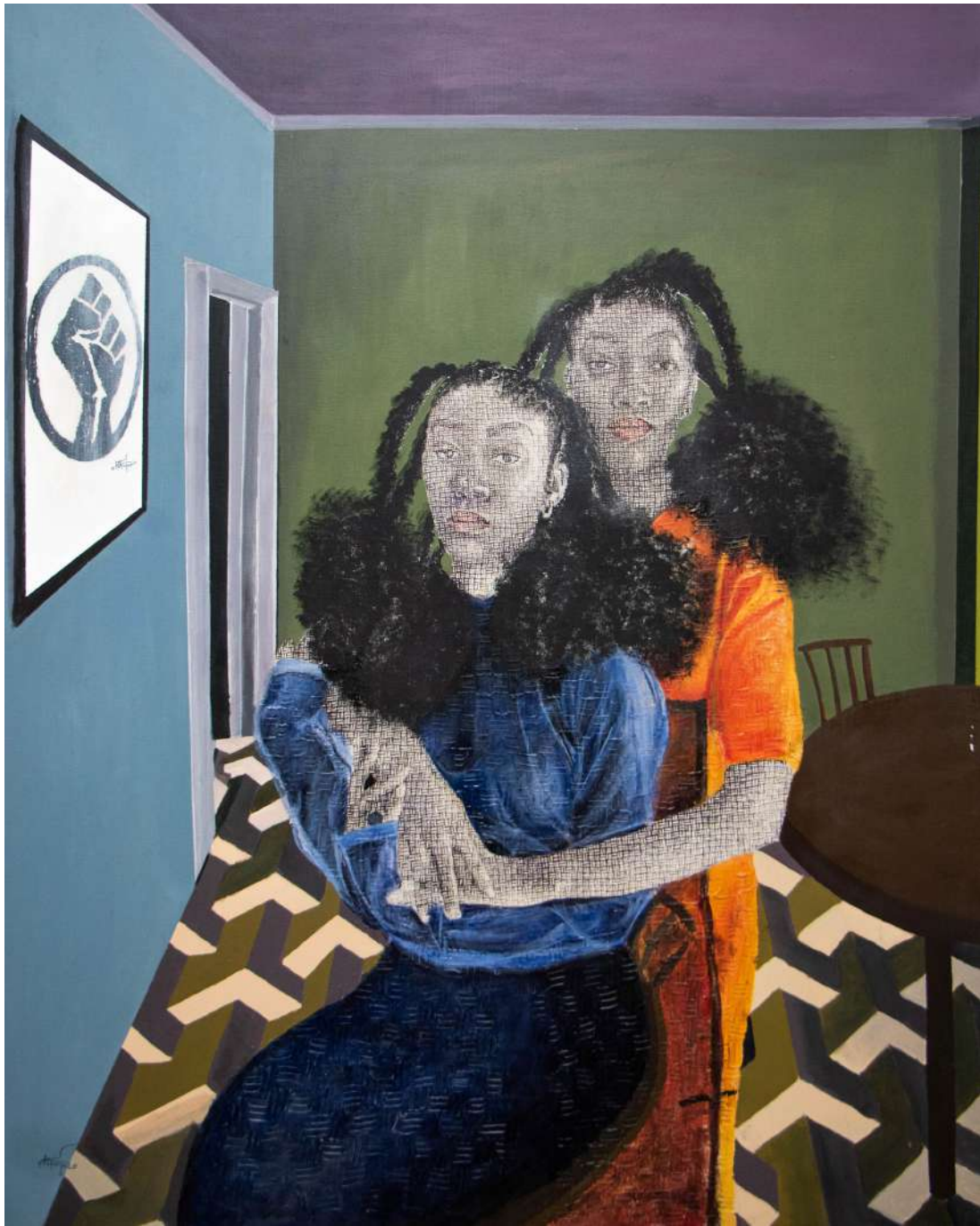
Soul Sisters I , 2020 Pen and Acrylic on canvas 121cm x 151cm