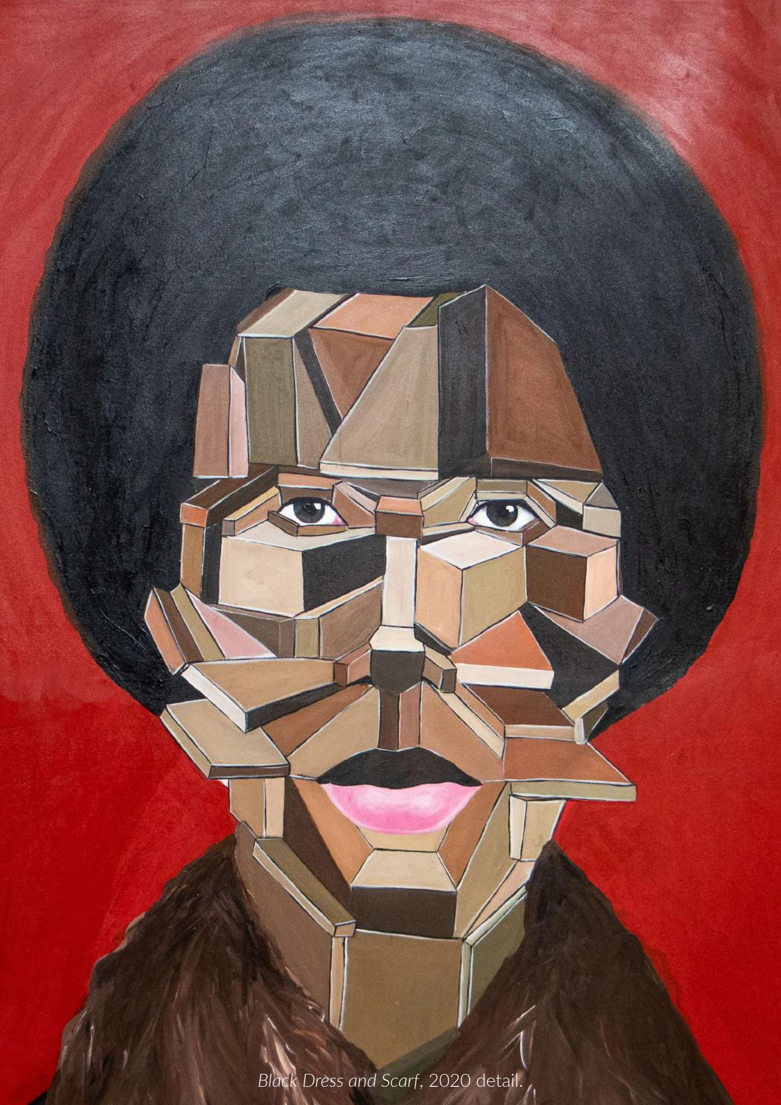
Black Dress and Scarf, 2020 detail.