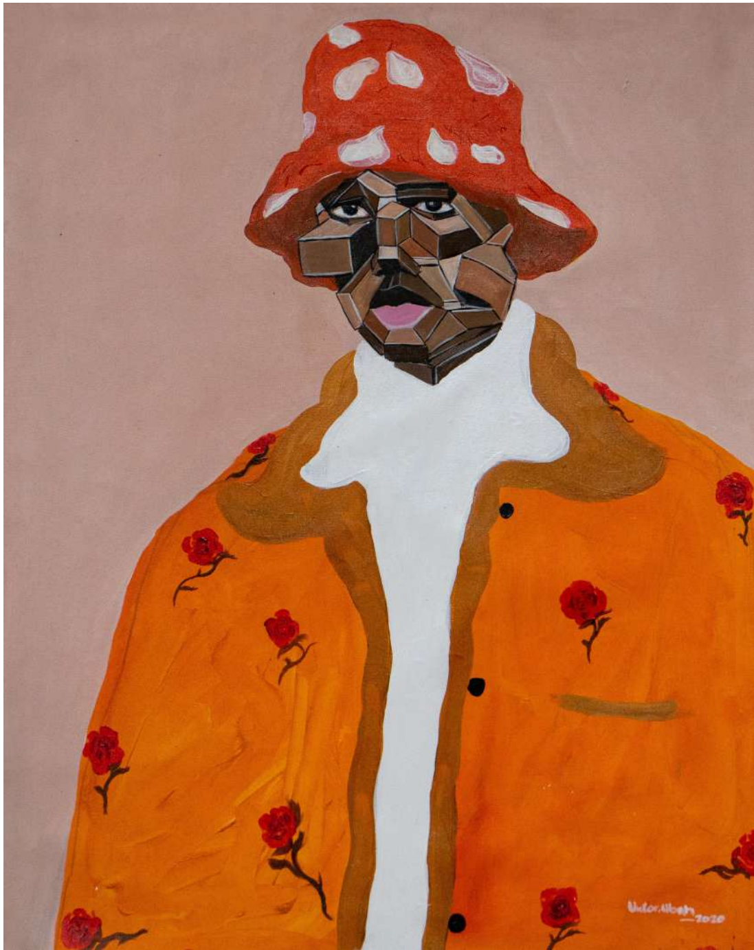
Orange Suit, 2020 Acrylic on canvas 65cm x 80 cm