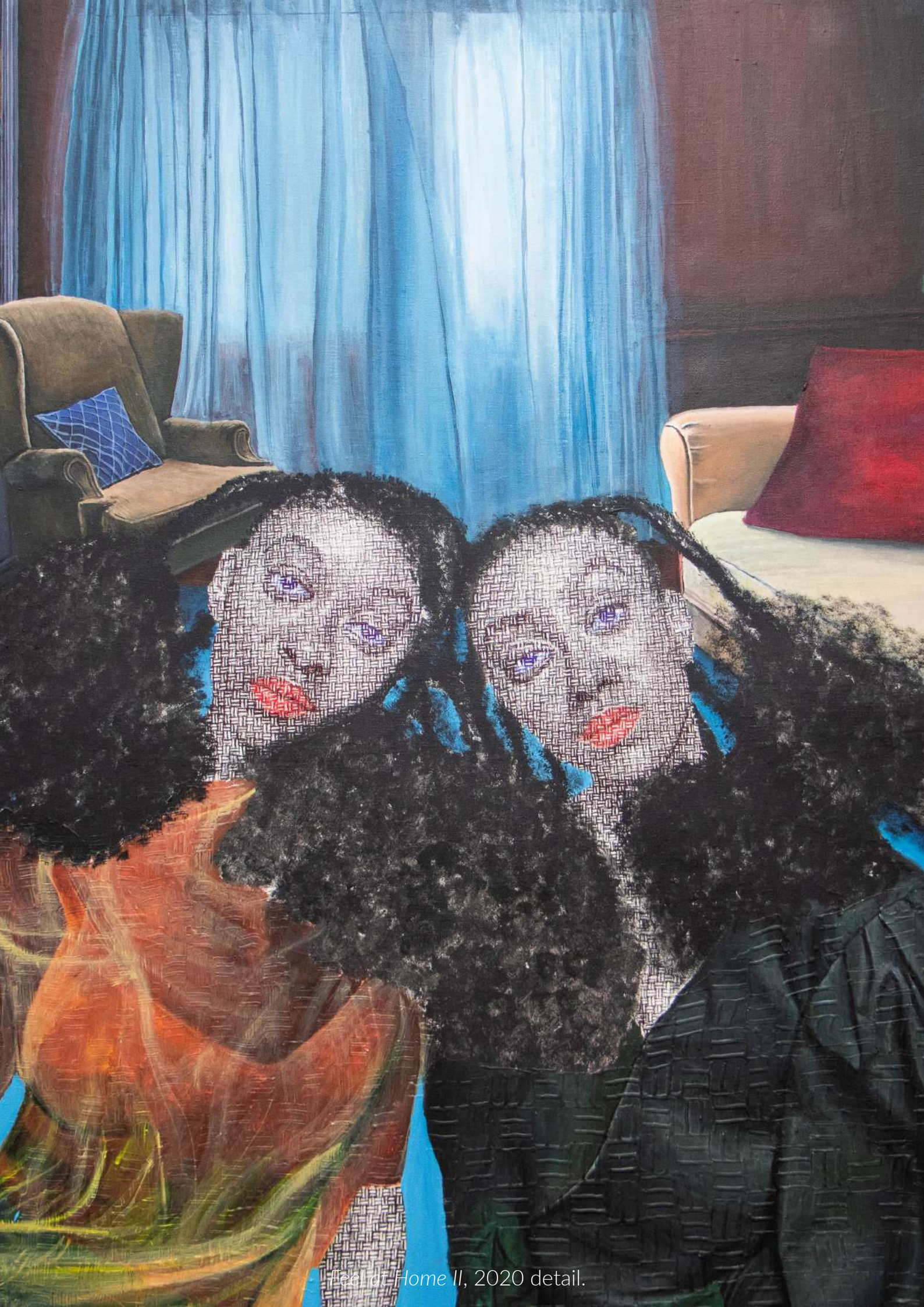
Feel at Home II, 2020 detail.