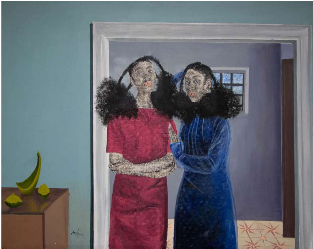
Soul Sisters II , 2020 Pen and Acrylic on canvas 121cm x 152cm