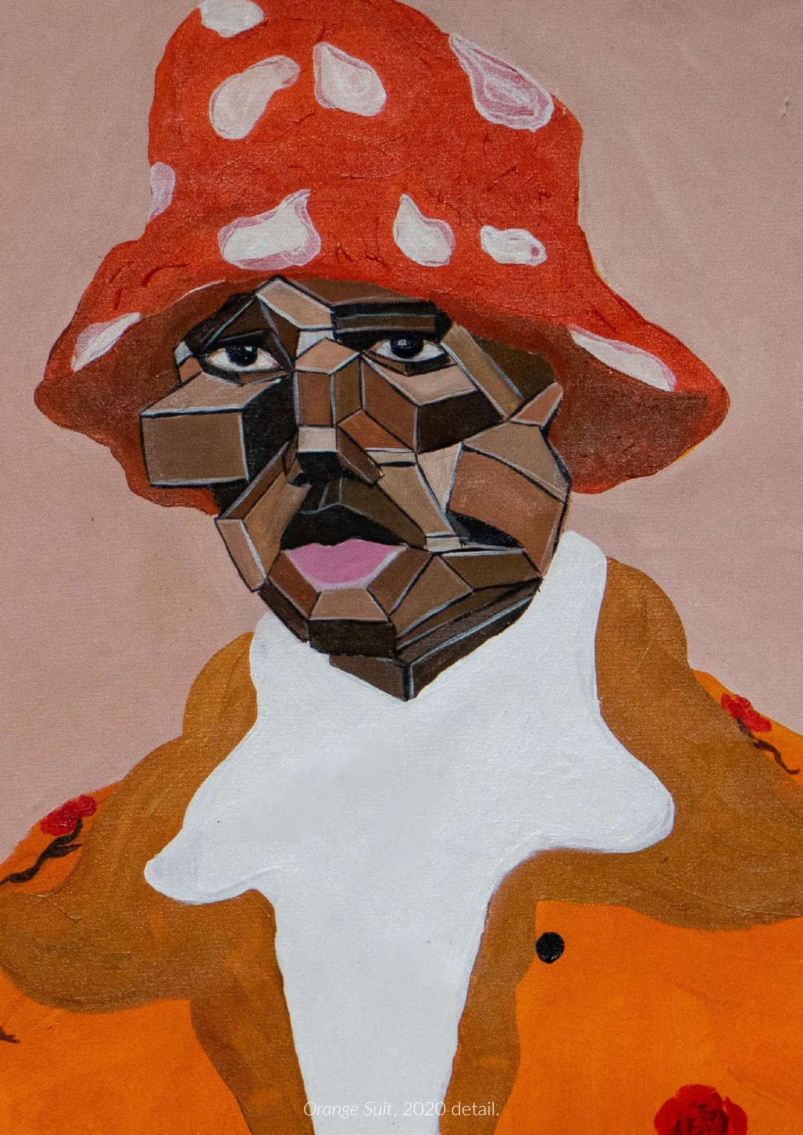
Orange Suit, 2020 detail.