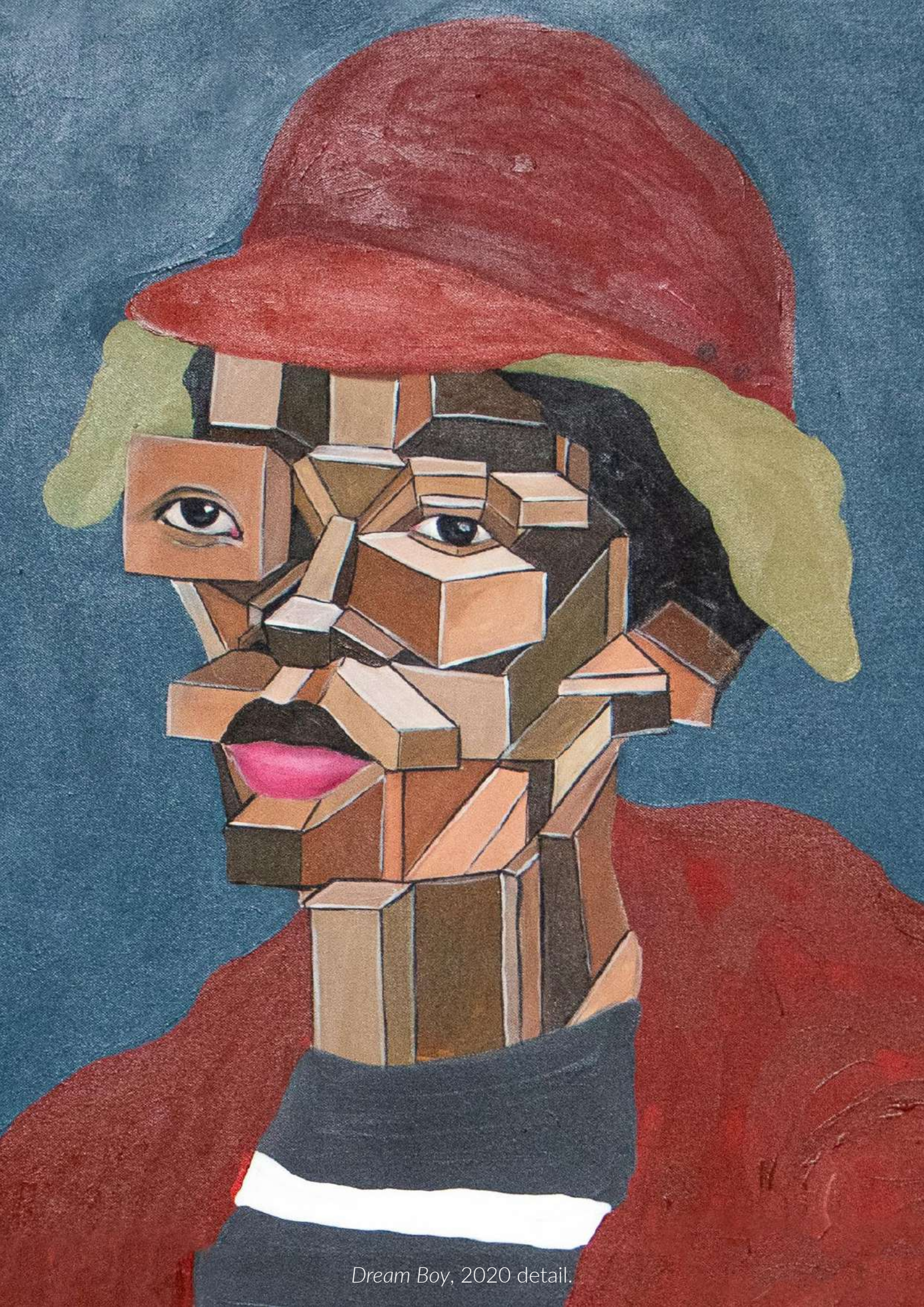
Dream Boy, 2020 detail.