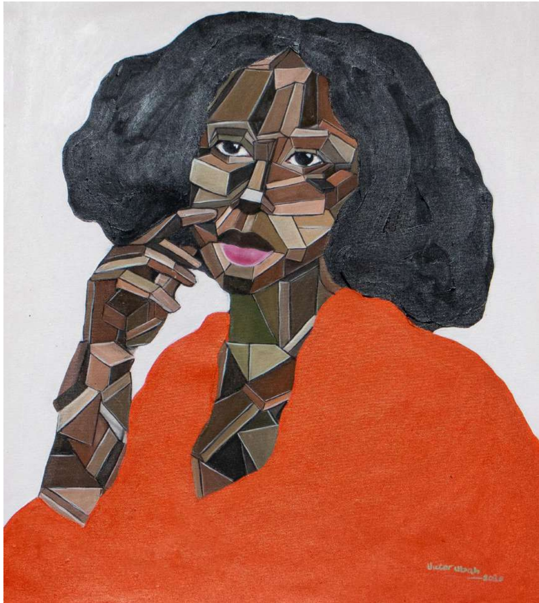
Orange Dress, 2020 Acrylic on canvas 21cm x 23cm