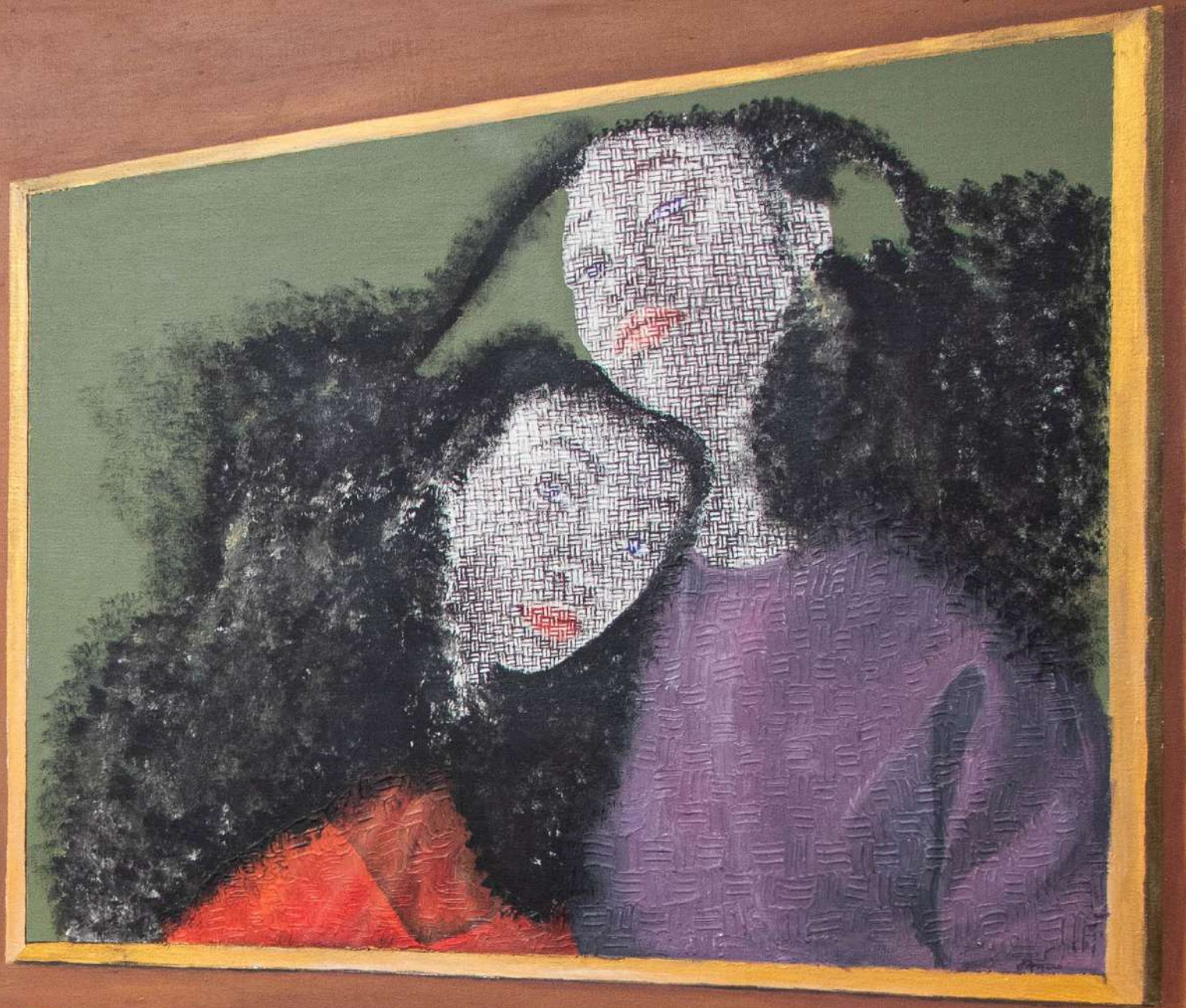
Feel at Home I, 2020 detail.