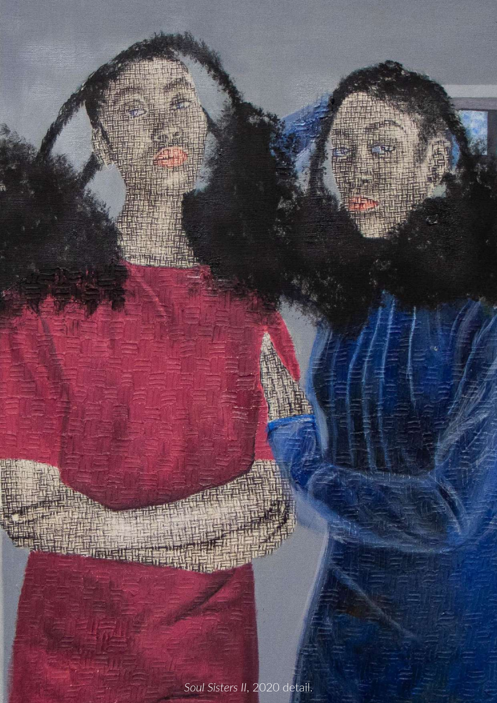
Soul Sisters II , 2020 detail.